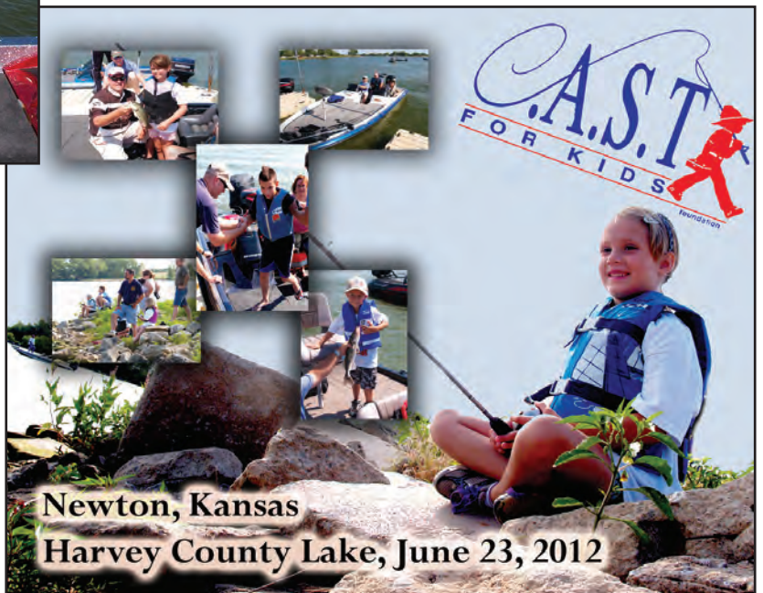
Newton, Kansas Harvey County Lake, June 23, 2012